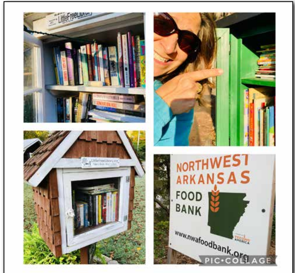
The other two panels are photo collages from several other Little Free Libraries.