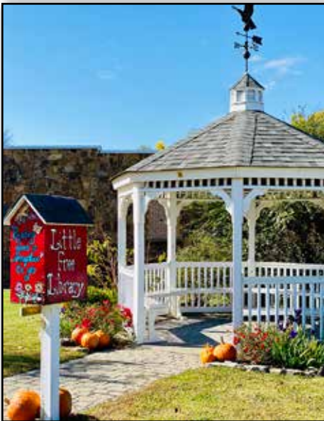
The photo above is from the Huntsville Little Free Library.