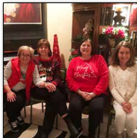
Beta Xi Chapter came together on December 7th for a meeting and Christmas Party. (More pictures on page 6)